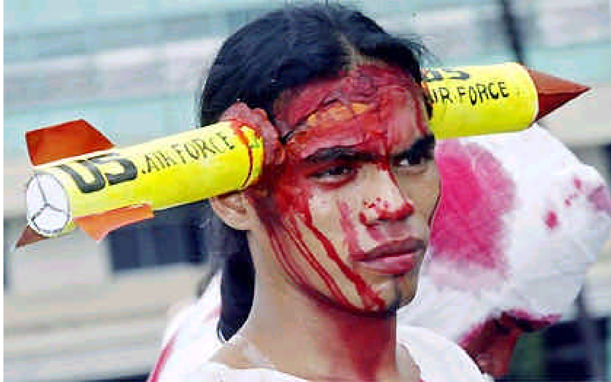
An Indonesian woman expresses her sentiments about the US Air Force's liberating role