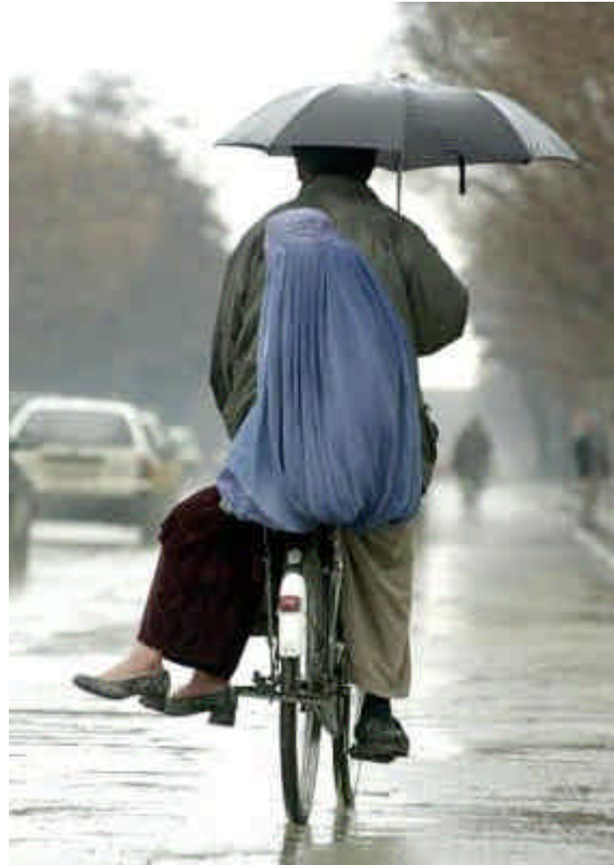
A.P. photo by Kamran Jibreili, March 14, 2003

I dedicate this file to the memory of the countless Afghans just engaged in simple acts of everyday living across the vast and beautiful land of Afghanistan, who became the innocent victims of the horrific U.S. air and ground onslaught begun at 9 PM on October 7, 2001. were they only able to ride a bicycle in the rain - or tears - of Kabul. Marc Herold, 03/15/2003.